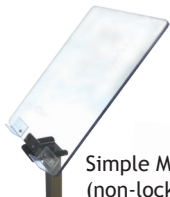
Simple Mount (non-locking)